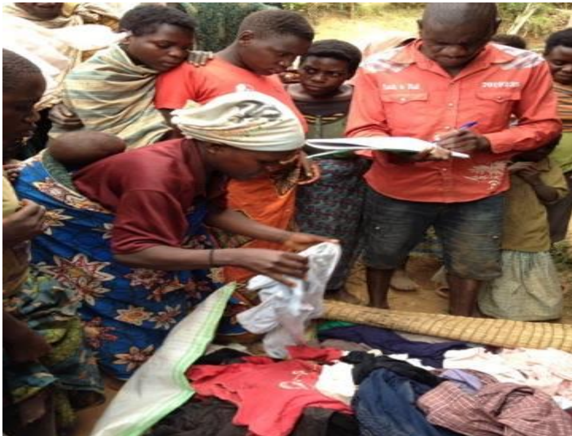
These are some of clothes we buy when we sold cabbages .