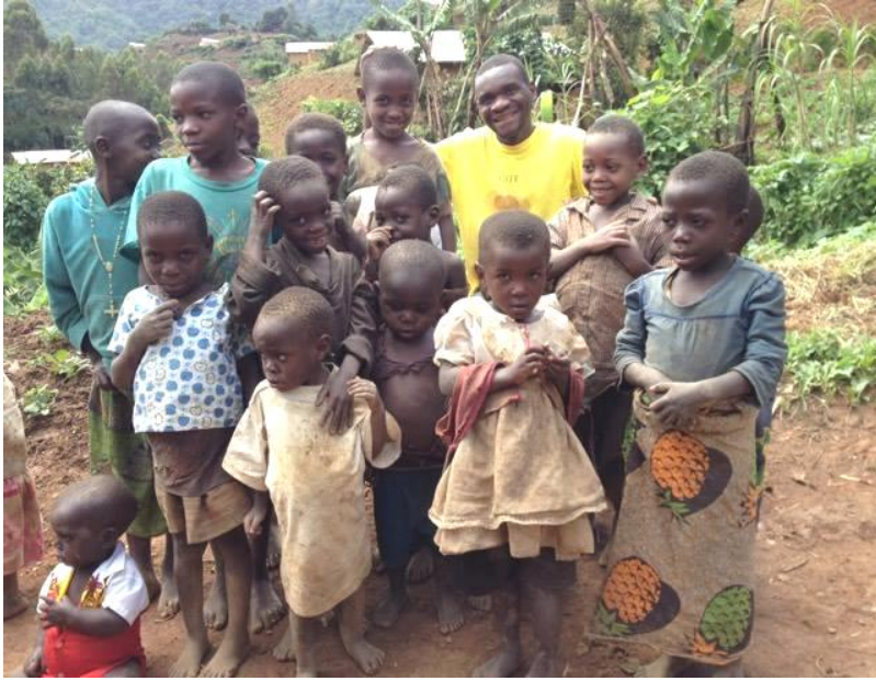
Batwa children so happy after having meeting with semajeri Gad about sensitization them how education is good